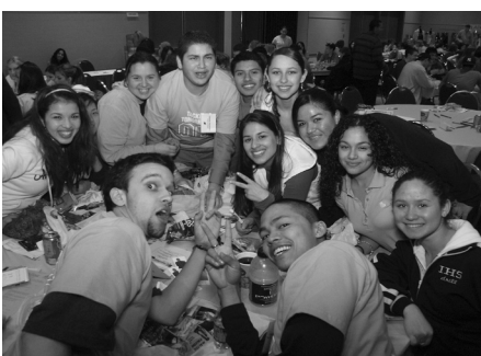
2006 Youth Involvement Conference to share opinions about youth needs; (3) connect with community resources; and (4) increase

The Youth Involvement Conference has four main objectives for Bellevue students: (1) learn about leadership skills; (2) provide opportunity