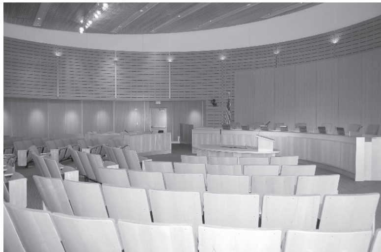
Bellevue City Hall: Council Chambers.

protection. From these experiences, he has been able to promote the rejuvenation of deteriorating, aged neighborhoods and create a core-class centered school—the nationally acclaimed International School. In the future, he seeks to ensure residential security and services (roads, waste handling, etc), aid for those needing assistance, alliances