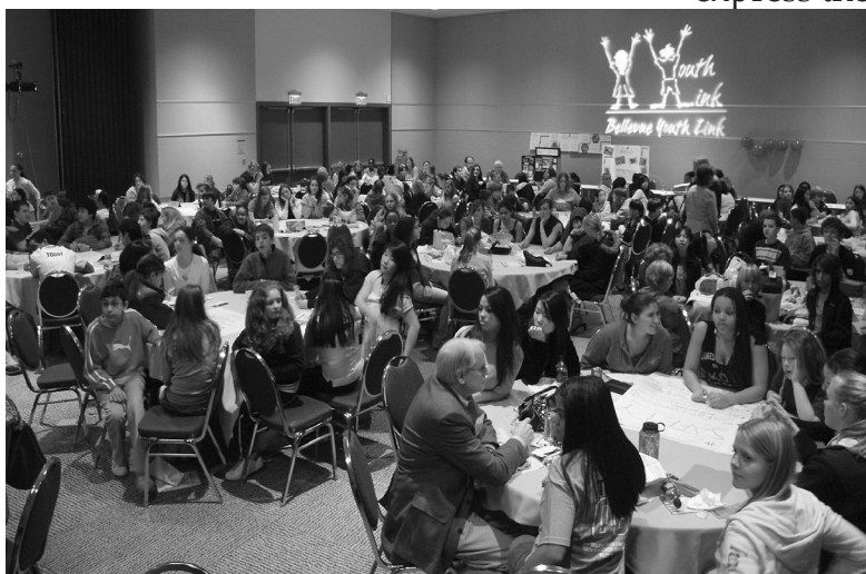
2006 Youth Involvement Conference. Bottom left and above photos courtesy of City of Bellevue

The Action Team, composed of local teenagers, is in charge of putting together the conference as well as advertising it at their schools. They coordinate the workshops, key